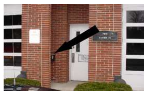
Drop Box Location

DROP BOX: Use the drop box for your water readings and tax payments in order to save postage.